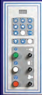
Electronic control system.

An advanced electronic control system allows greater versatility, delivering optimum results for every pallet wrapping application.